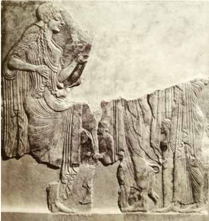
Fig. 10. Marble votive relief from the Athenian Acropolis, 5th century BC. Athens, National Museum, inv. Acr. 581. Avramidou 2015, fig. 5.