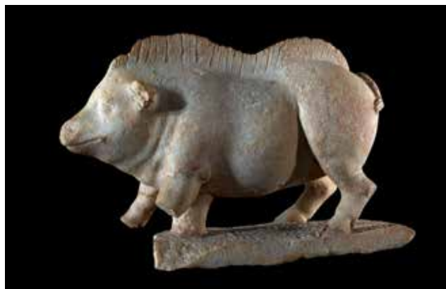
Fig. 2. Sow S1, left side and inscribed plinth. H: 41.9 cm.