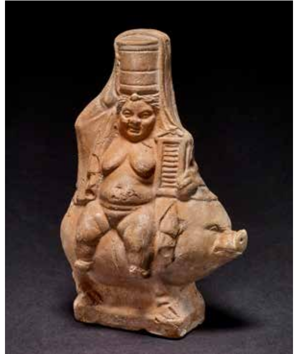
Fig. 11. Woman riding a pig. London, British Museum, BM Terracotta IV, no. 3169, from Fayum, Ptolemaic Egypt.

ures and children riding very fat and likely pregnant sows. 33 The cists and stelai that the women carry also suggest elements of eastern rituals, but their headdresses are reminiscent of those worn by priestesses in the Greek world. These women also present iconographical similarities with the character of Baubo, who offers comic relief to the mourning Demeter through making obscene jokes and uncovering her genitalia. 34