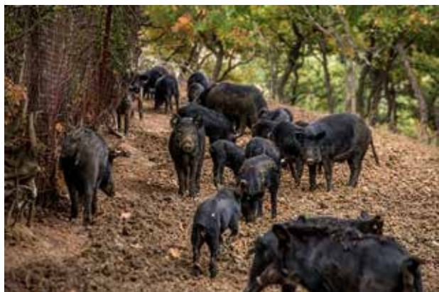
Fig. 6. Indigenous black pigs at Fotiadis Farm, located in Exochi, at the foot of Mount Olympus.

found in the same sanctuary. 19 The longest, and latest, was carved on a block of blue marble and reads: “Δάματρι καὶ Κούραι καὶ τοῖς θεοῖς τοῖς παρὰ Δάματρι καὶ Κούραι χαριστεῖα καὶ ἐκτίμα-τρα ἀνέθηκε Πλαθαίνης, Πλάτωνος γυνή” (Plathainis, wife of Platon, to Demeter and Kore, and the gods beside Demeter and Kore, as gratitude and veneration offerings). 20 This indicates that her last offerings at the sanctuary were offered to Demeter and her daughter Kore but also to other gods next to them, possibly meaning that those other gods had their statues set close to them (other inscriptions in the sanctuary mention Pluto Epimachos, Hermes, and perhaps Hekate and the Dioskouroi), as charisteia