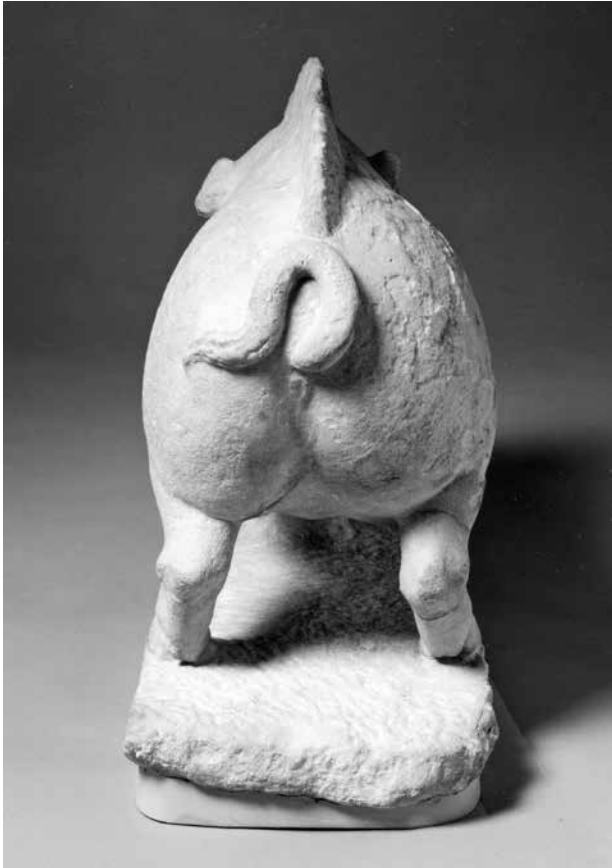
Fig. 7. S1, back.