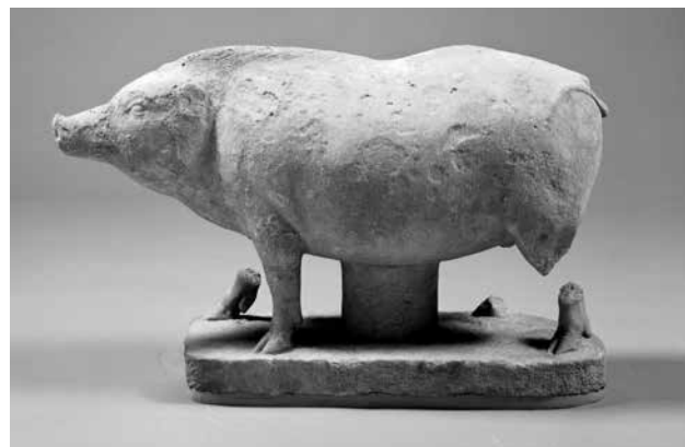
Fig. 3. Sow S2, left side. London, British Museum, inv. 1859,1226.29. H: 23.2 cm.