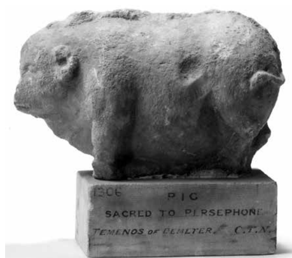
Fig. 5. Sow S4, left side. London, British Museum, inv. 1859,1226.31. H: 22.3 cm; L: 33.4 cm; W: 14.1 cm.