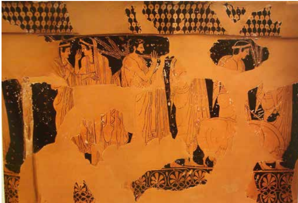
Fig. 9. Red-figure loutrophoros by Phintias. Athens, National Museum, inv. Acr. 636. Avramidou 2015, fig. 4, after Kaltsas & Shapiro 2008, 256–257, no. 116.

Kore), and are likely linked with the rites of the Thesmophoria. There are a few statuettes of boys carrying piglets at Eleusis, and many figurines of both pigs and women carrying piglets at Acrocorinth. 25