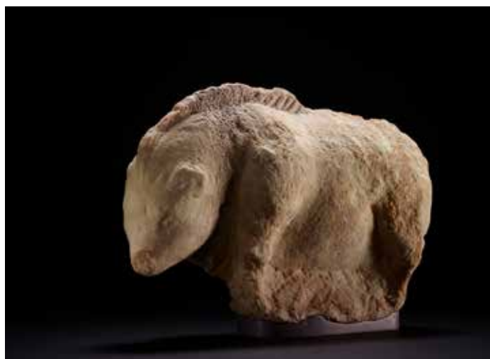
Fig. 4. Sow S3, left side. London, British Museum, inv. 1859,1226.30. H: 23.2 cm; L: 33 cm; W: 12.8 cm.