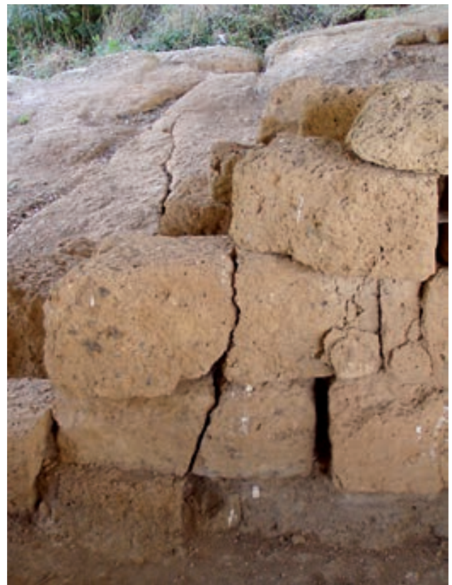
Fig. 125. Crack in the tufa blocks in wall L1 continuing into the bedrock Na, seen from the south.

This conclusion is amply confirmed by the better documented