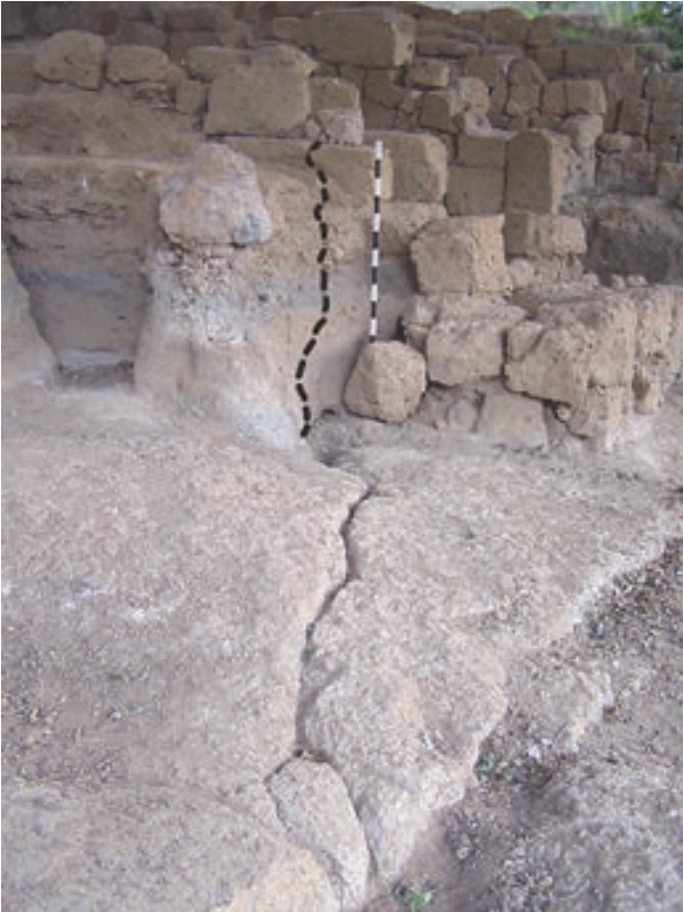
Fig. 123. Crack in the rock Na in room Ab from the north.