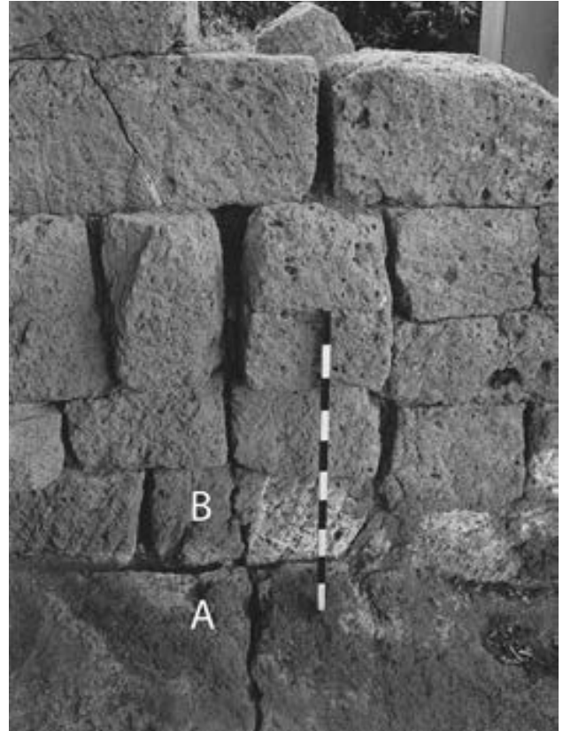
Fig. 124. Cracks in the tufa rock (at A) and the wall D3, block II:5 (at B).