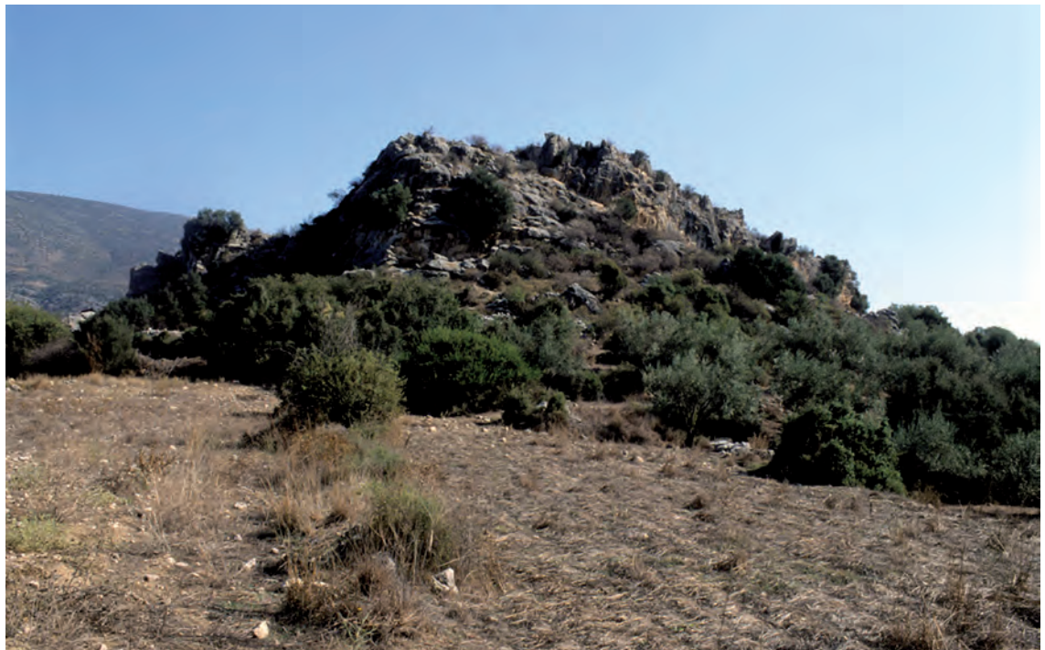
Fig. 29. Ploughed fields at the base of the northeast of the Mastos Hill in 1999.

nal unit, thus largely restoring the original contexts of the artefacts. Our rationale for this was that the terraces in this stable landscape, and the fields at the foot of the hill, if not all still cultivated, had been so as late as two generations ago (Fig. 29) and for generations ploughs and harrows had transported the surface material back and forth plenty of times. Therefore, our interventions into a kind of blanket of archaeological material were no greater than agriculture or nature itself had caused over hundreds of years.