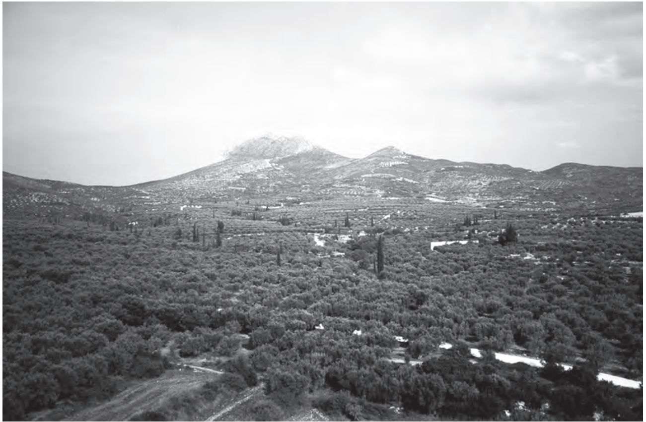
Fig. 11. A view of the western part of the Berbatí Valley towards the mountain Propitís Elias by Mycenae. Kondovouni can be made out in front of the mountain. On its left flank a thin grey line represents the Mycenaean road, where it is well preserved on the hard limestone bedrock; on its right flank only dense vegetation marks its course, as the road bank has eroded away on the softer flysch. Right of the centre of the photograph the well-preserved wall of the mill-race of the water mill, Standing Monument 15, can be seen. The tholos tomb lies slightly to the east.

named “Erste Hochstrasse” or the first highway. 22 We have assumed, as has indeed Richard Hope Simpson, contra Anton Jansen, that the rulers of Mycenae incorporated the Berbatí Valley into their realm in the Late Helladic IIIA2 period. 23 The first highway, by which a large settlement was identified during the 1988–1990 survey (FS 14), was undoubtedly constructed as a means of connecting dependencies with the Mycenae citadel. It is highly likely that the Stephani plateau, as argued also by Hope Simpson, was drawn into the Mycenaean ruler’s sphere of interest at the same time, as the first highway continues north in the direction of the Kephalaria (Κεφαλάρι) spring on this plateau.