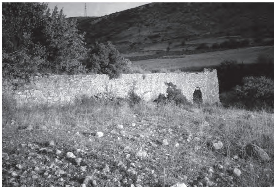
Fig. 26. The water mill, Standing Monument 12, situated south of the Mastos Hill, in the 1990s. Only the mill-race is preserved.