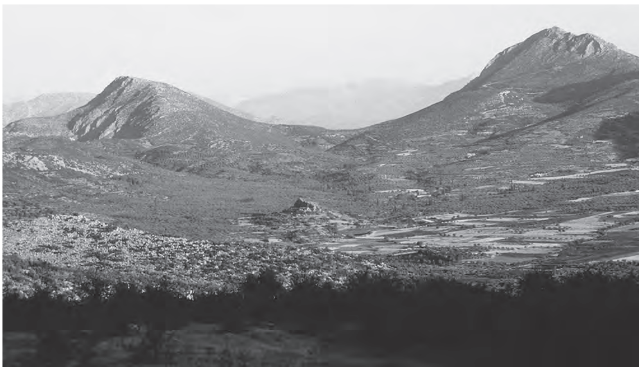
Fig. 1. A view of the western part of the Berbati Valley with the Mastos Hill in the centre and the mountains Zara (on the left) and Prophitis Elias (on the right). Behind them lies Mycenae. In the far distance are the mountains of Arcadia.

The Mastos Hill had to be excluded from the field permit due to the extensive excavations conducted there in the 1930s and 1950s. 9 The survey aimed at giving a diachronic account of a politically and economically important area in a little-known corner of the Argolid, and was published in 1996. Yet, it was only the first of three surface investigations carried out in the valley and methodologically it differed totally from the two later ones. 10 More will be said about this below. However, let me first say a word about the immediate sequels to the 1988–1990 survey. 11