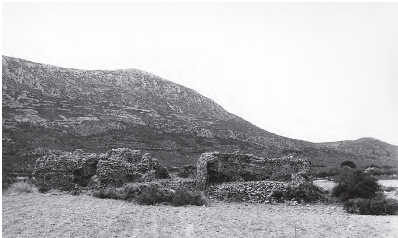
Fig. 8. The ruins of the Roman bath by the east-west road through the Berbati Valley.