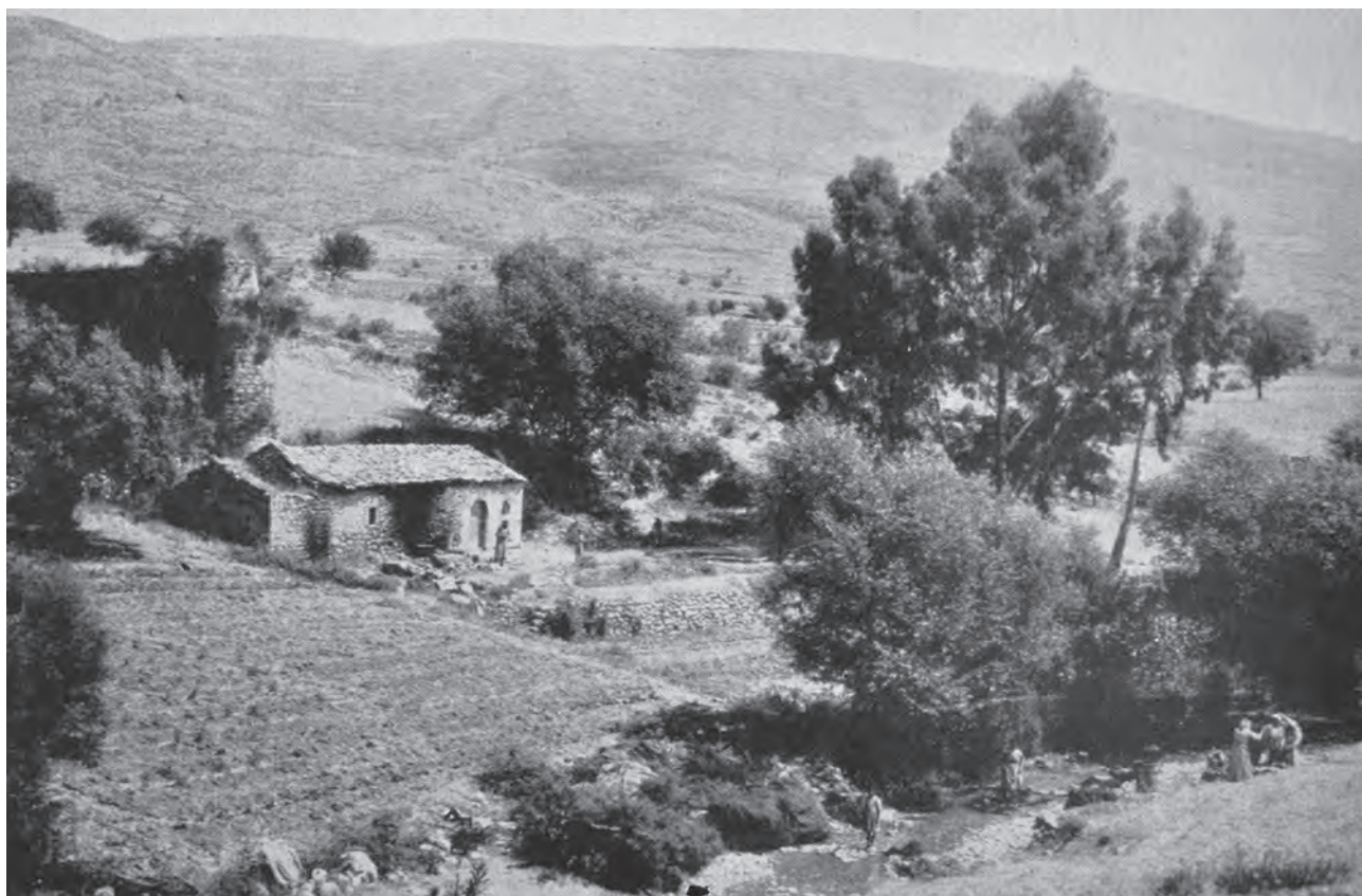
Fig. 23. This water mill by the Asterion (designated Standing Monument 11 in the 1988–1990 survey) was still in use in 1935, when the photograph was taken. Note also the women washing clothes in the stream. In the background the ridge of Psili Rachi. Photograph in the Åke Åkerström Archive, the Swedish Institute at Athens.

Nauplion Museum storerooms. 42 The target area of the survey comprised roughly 3.7 ha, of which 26 percent were inaccessible, being rocks, terrace walls or very dense vegetation (see Savini in this volume). As the Mastos is a heavily terraced hill, and the terraces are not very large, it lent itself to a division into reasonably small units (1–64) with natural boundaries ( Fold-out 2 ). Only in a few cases were terraces and fields on the lower slopes divided into smaller units.