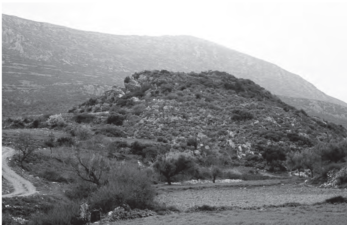
Fig. 21. View of the northern slopes of the Mastos Hill in 1999. A comparison with Figure 27, a photograph from 1935, reveals the degradation of the terraces in the intervening years.