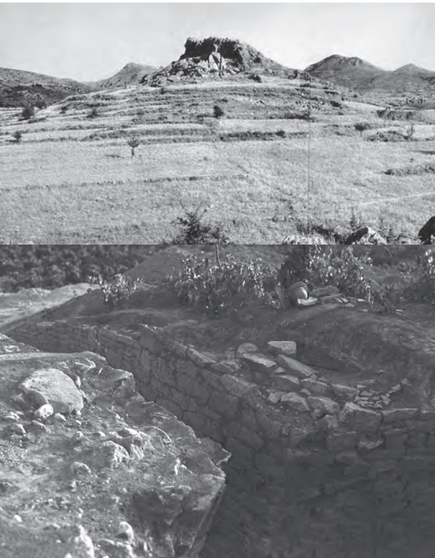
Fig. 2. The Mastos Hill from the east in 1935.