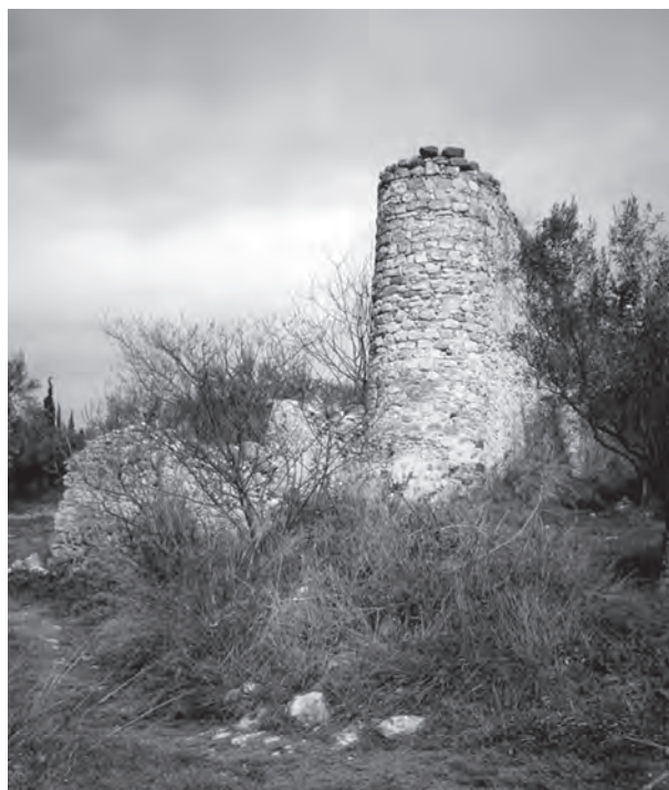
Fig. 25. The water mill, Standing Monument 15. As in Standing Monument 12 (Fig. 26), the mill-race is fairly well preserved while the associated structure lies in ruins.