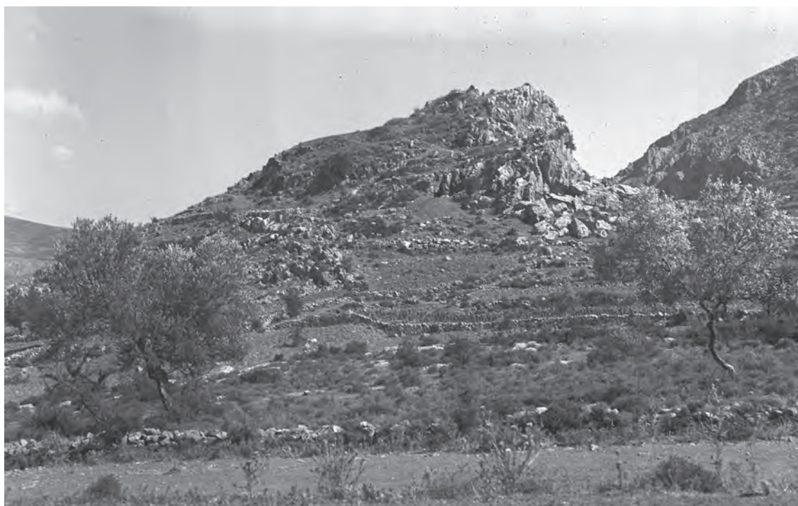
Fig. 27. View of the western side of the Mastos Hill in 1935. Note the well-preserved terracing on the slopes.