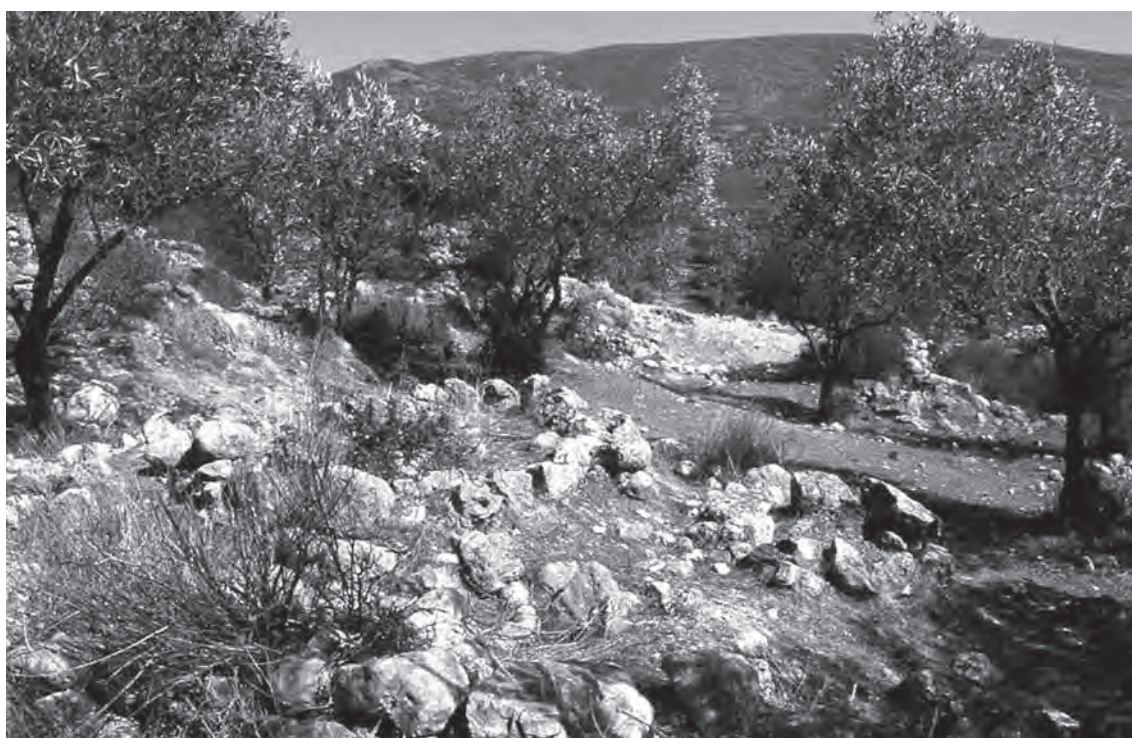
Fig. 28. The Potter's Quarter from the south in 1999. The kiln is still identifiable.