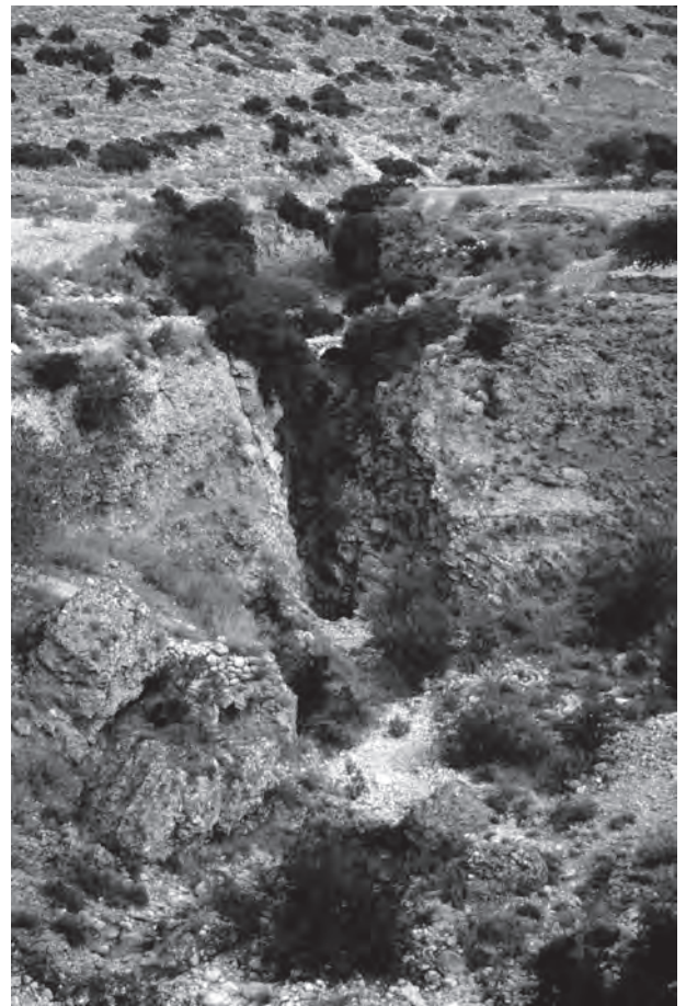
Fig. 18. The modern kondoporia diagonally traversed the Berbati Valley from the Klisoura ravine in the southwest to the slopes northwest of the modern village of Prosymna. There, this bridge, locally referred to as Tourkoyefira (Τουρκογέφυρα), carried the road across a ravine. The bridge does not look Ottoman; it may be substantially earlier. The modern road probably ran essentially the same course as an ancient road, of which stretches are preserved south of the bridge. Probably this ancient road can be identified with the kontoporeia in the ancient written sources.

Seasonally in the past, the Asterion undoubtedly turned into a torrential stream on its way down the ravine towards the Klisoura, which connects the valley with the Argive plain ( Fold-out 1 ). The area of the stream consists of flysch, which was easily eroded by the running waters creating the present