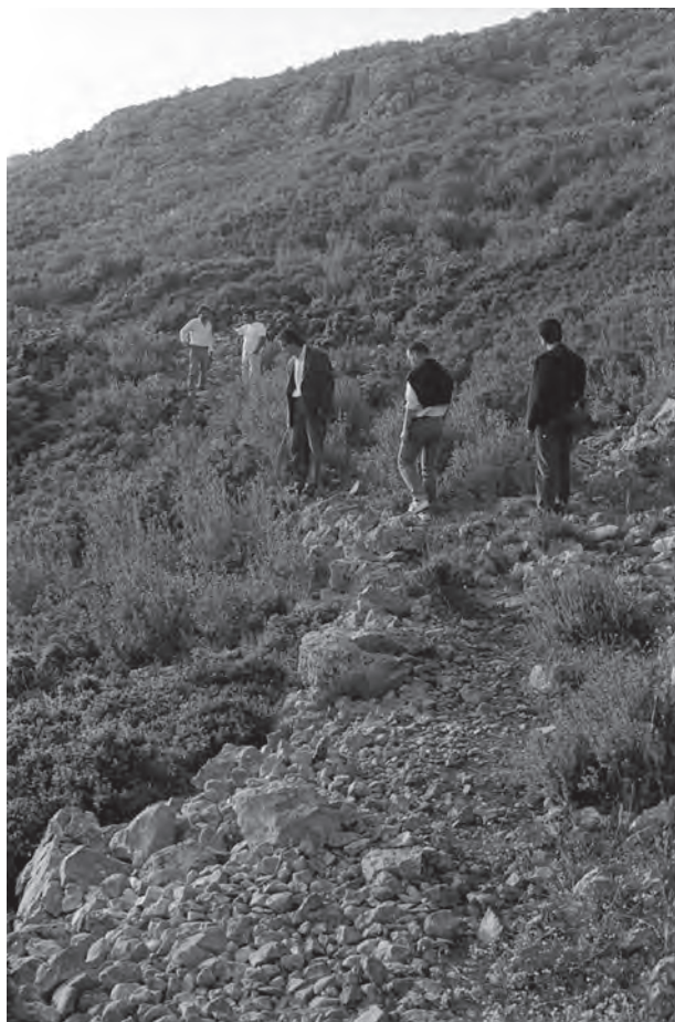
Fig. 19. A walk together with friends from Prosymna along the kondoporia in 1989. These preserved stretches of the kalderimi towards Ayionori lie on the slopes of the Psili Rachi in the northeast. Photograph by B. Wells.