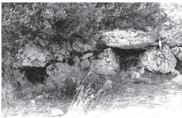
Fig. 14. Preserved road bank of the Mycenaean road on Kondovouni during the 1988–1990 survey.