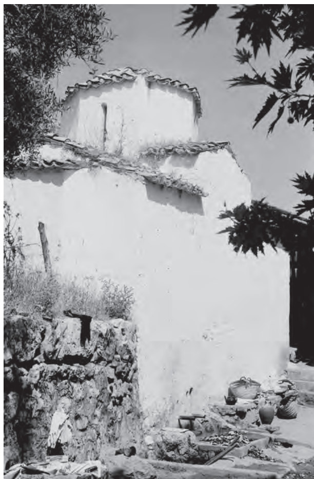
Fig. 12. The Panayia Chapel on the northern slopes of Euboea with the harnessed waters of the rich spring. As can be seen, this is where the potsherds were washed during the 1930s excavations at Berbati.

the north in the direction of the Stephani highlands above Psili Rachi (Ψηλή Ράχη). 25