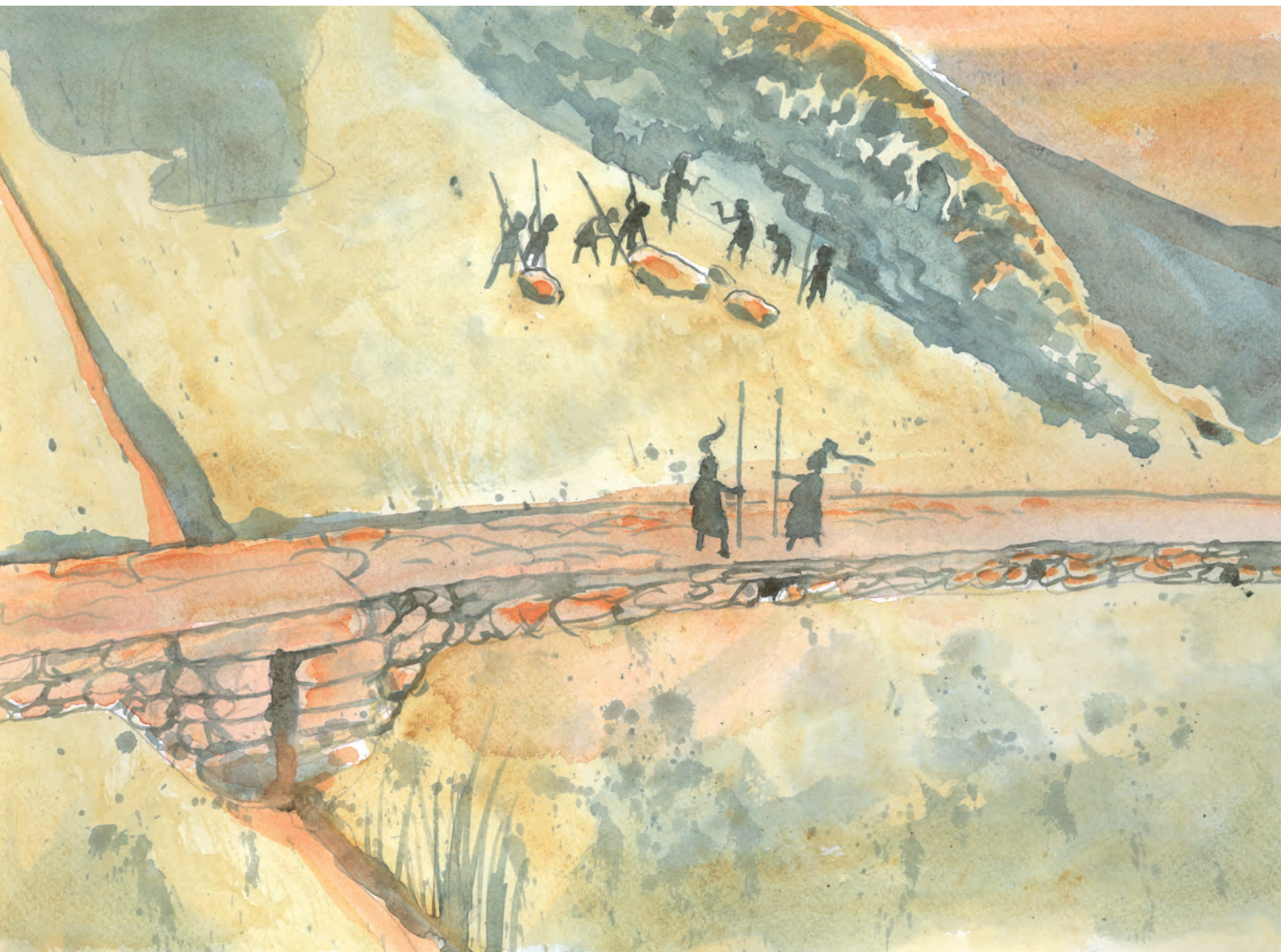
Fig. 13. Stone for the Mycenaean road was obviously quarried locally. On the slope of Koutzoyanni, to the east of the Lykotroupi Bridge (an unusually large culvert), one such quarry was identified. This watercolour by Attila Tóth depicts Mycenaean workers extracting the blocks and building the road.

Between the Euboia and the Zaira another passage may have offered a route of communication from prehistoric times to the present day. A watchtower at Mourteza (Μουρτέζα) (Fig. 17), probably datable to the fourth century BC, lies in a mountain pass from the Argive Heraion to the Berbati Valley. Here may be another ancient route of communication. It has been mapped by both Steffen and Lavery. 31