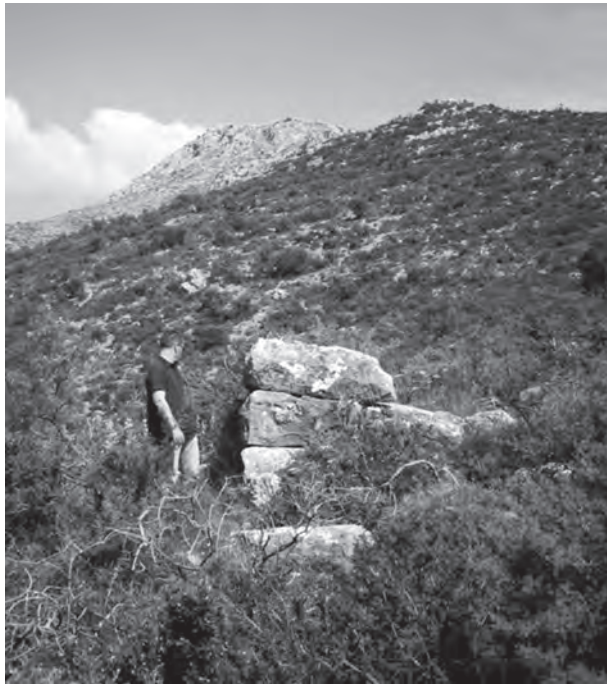
Fig. 17. The tower at Mourteza. This probably fourth-century structure lies close to a spring above the head of the Plesia ravine at the northwestern tip of Euboea in the saddle between this mountain and Zara.

ous stream ...". 36 However, as irrigation became the rule, the waters of the spring were diverted for irrigation and nowadays the streambed carries water only after heavy winter rains. 37 The remains of five or perhaps as many as eight water mills along the rema testify to its past importance as a source of water. 38 The mills were documented during the 1988–1990 survey. 39