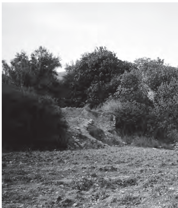
Fig. 24. The water mill, Standing Monument 11, in 1999.