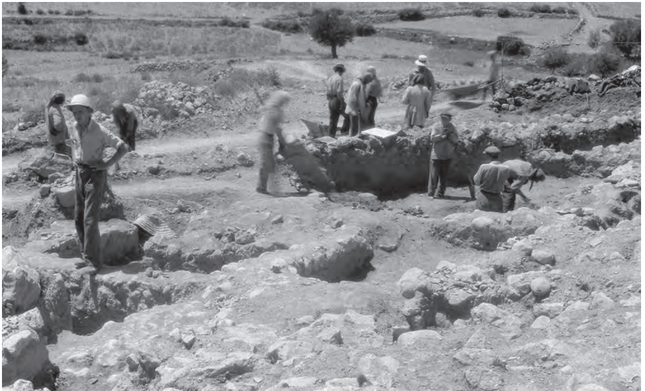
Fig. 6. Excavations in the Potter's Quarter in the late 1930s.