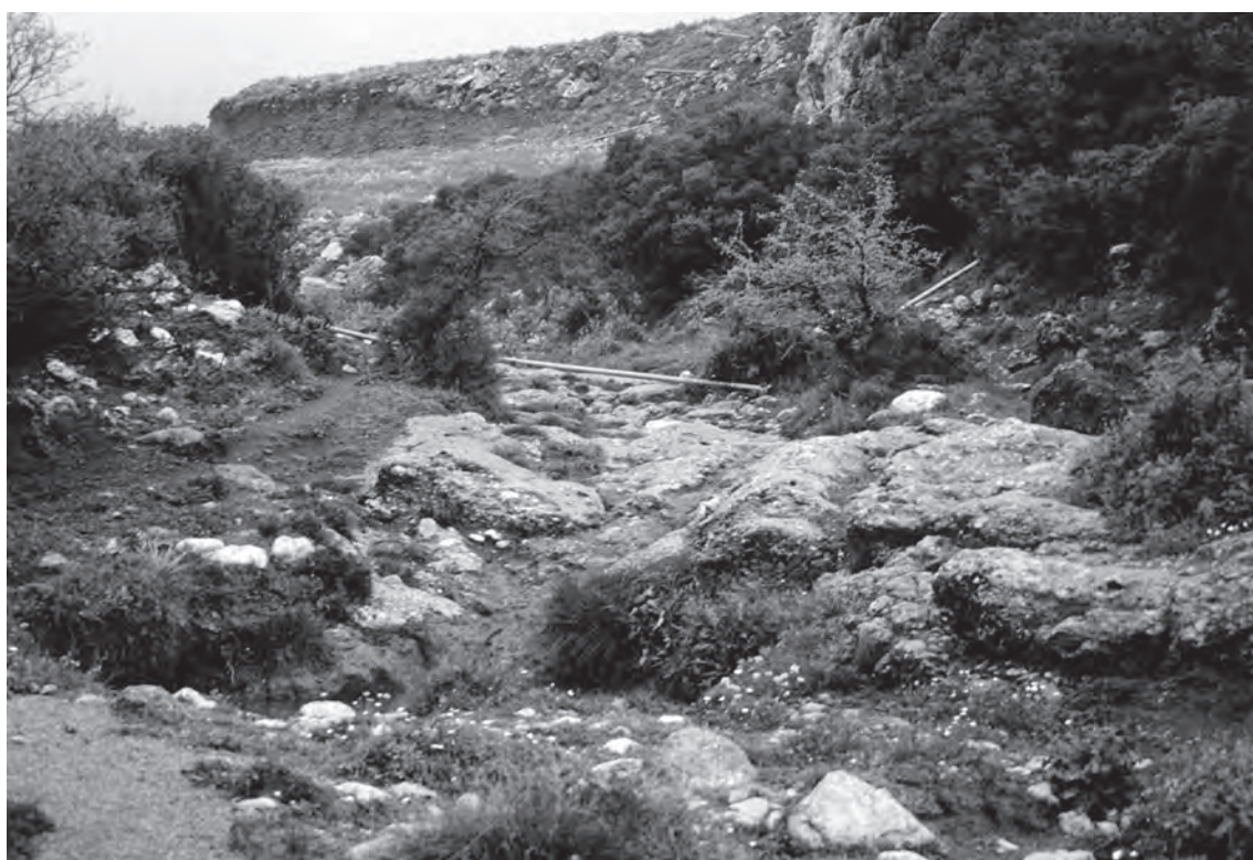
Fig. 22. The source of the Kephalaria spring in 1991. A view towards the south. The ancient remains on the right are of historical date.