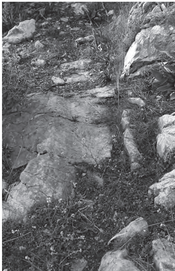
Fig. 20. This stretch of the kondoporia attests to the route being well-travelled until modern times.

utilized. Moreover, the terraces on the northern slope have not been maintained to the same degree as the ones on the other slopes (Fig. 27). They may simply not have been of such great importance either for habitation or perhaps for widespread cultivation in view of the fact that the sun did not reach them in the same way that it did the other sides of the hill; in later history we know that settlements looking north were considered unhealthy. Nauplion is a case in point.