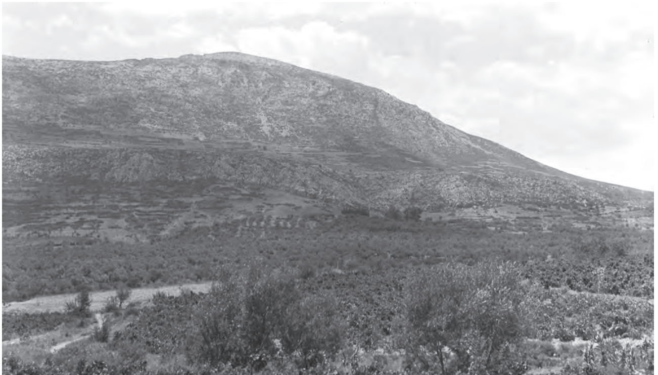
Fig. 7. A view towards the mountain of Euboea from the Phytesoumia spur during Gösta Sjöflund's excavations in the Western Necropolis.