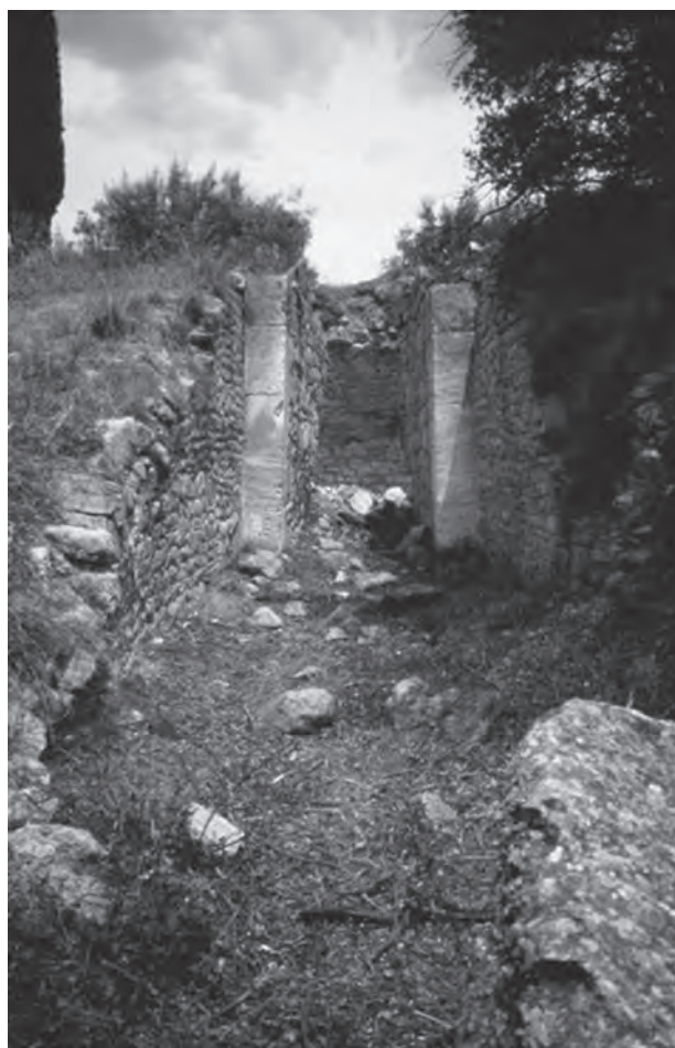
Fig. 5. The tholos tomb at Berbati in 1989.

the knowledge of the parameters of each separate survey project. 16 The lesson we learnt at Pyrgouthi was further underscored at the Mastos Hill. Here, as we will see, the intensive sampling involved collection of all material in each unit, which could be seen as yet another step towards as complete a knowledge as will ever be possible to obtain of the history of human activity such as it can be written from a surface survey.