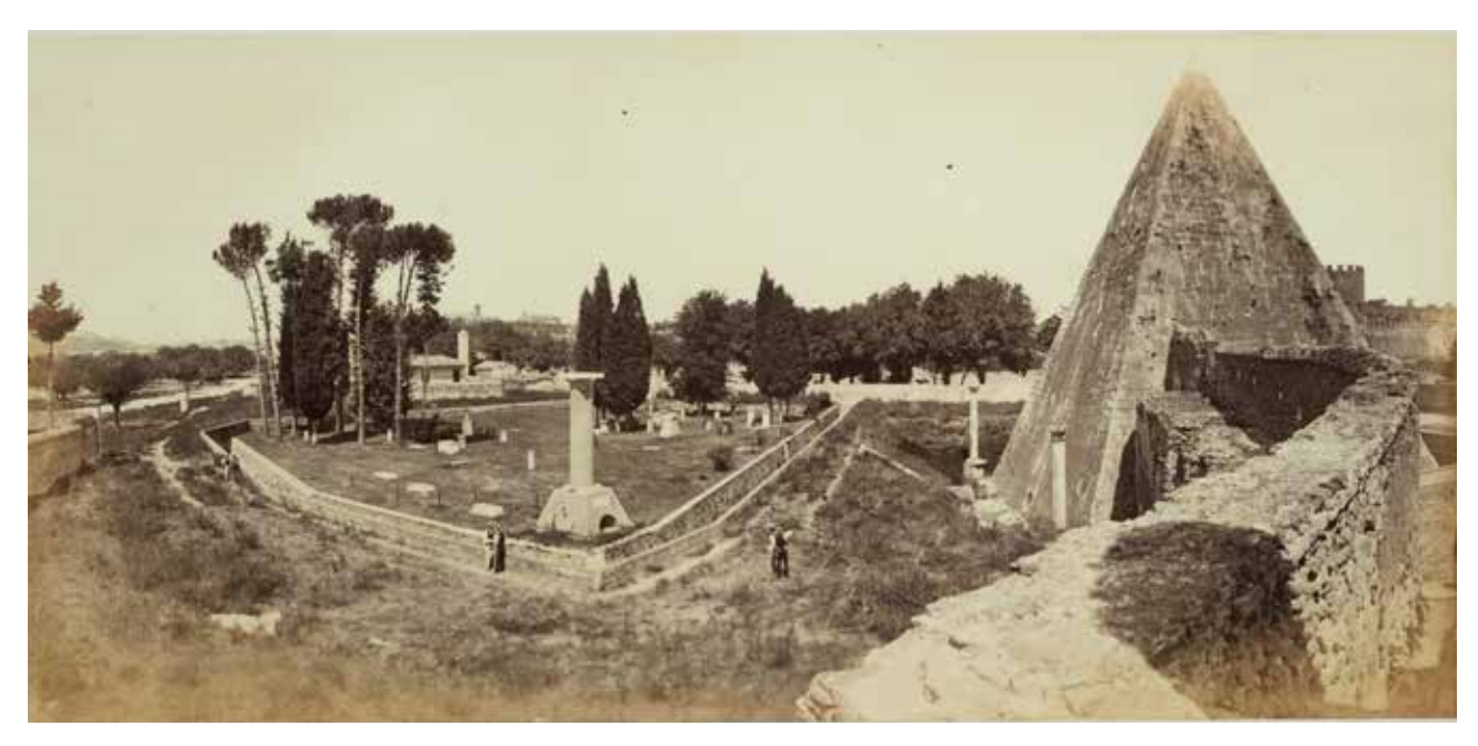
Fig. 2. Robert Macpherson, View of the Pyramid of Gaius Cestius and the Old Cemetery, c. 1864. Note the walled moat with the Bowles monument centre foreground, and the staircase down to the Pyramid entrance.

would have been the three monuments that are known to have been standing at that date, namely those of Werpup, Macdonald, and Stevens (see Table 1). The lack of earlier evidence for stone memorials and de Sade's surprise in 1775 at seeing three of them render it unlikely that others had been erected in the period 1716–1765 and have subsequently been destroyed.