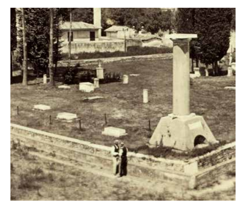
Fig. 3. Detail of Fig. 2 showing alignment of three ledgers and five wooden posts.

A third photograph (also attributed to James Anderson, c. 1860, unpublished, McGuigan Collection) shows another