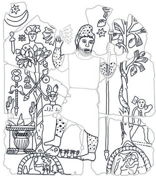
Fig. 2. Bronze plaque from Emporiae, now in Girona Museum. Drawing by the author after Lane 1985, fig. 85.

The main material evidence of the cult are the sculpted hands in bronze, usually at life size or smaller, of which there are around 80 examples, in addition to 14 figurines or busts that were probably once attached to hands. 15 As well as the hands,