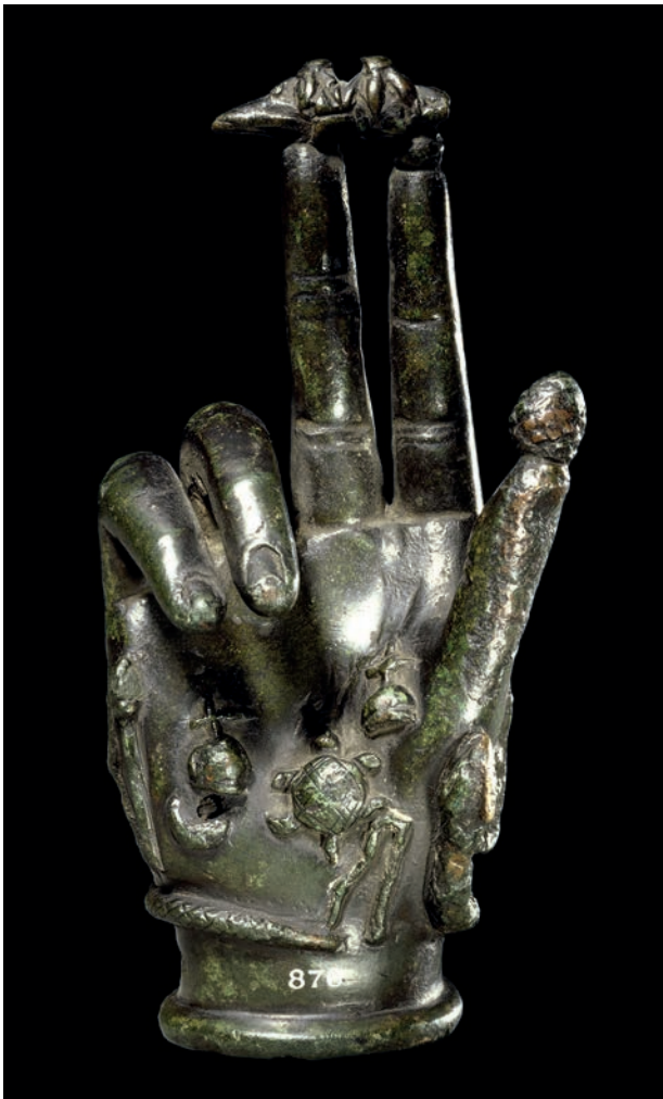
Fig. 1. Bronze hand found at Tournai in Belgium, close to the Belgian-French border, now in the British Museum, inv. no. 1895, 0621.4. Height c. 15 cm.