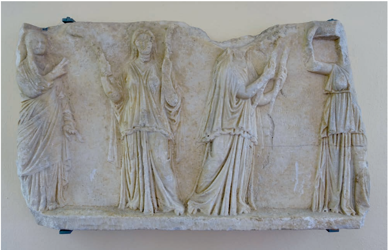
Fig. 9. Two parts of a marble relief likely from Halicarnassos are preserved in two different museums. This is the part in the Martin von Wagner Museum in Würzburg, inv. no. H 4794. The woman on the far left makes the benedictio Latina gesture with her right hand.