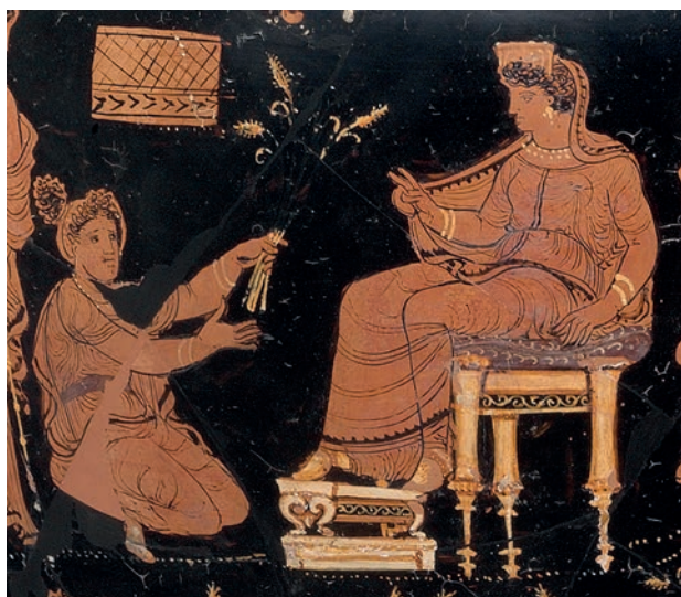
Fig. 10. Demeter makes the benedictio Latina gesture with her right hand while seated on a throne, as Metaneira kneels in front of her. Apulian hydria, c. 360/350 BC.