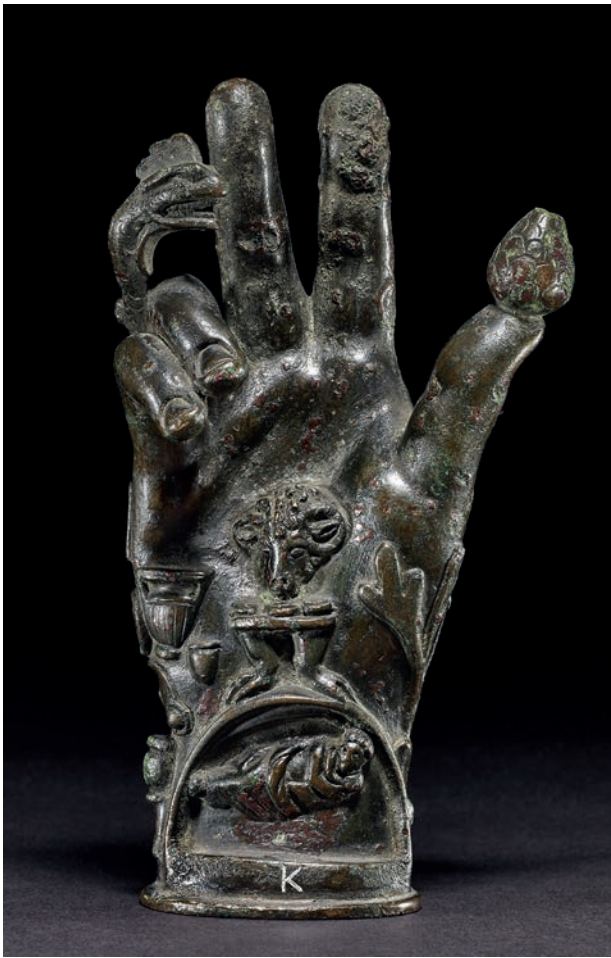
Fig. 11. The palm side of a bronze hand of Sabazios. 1st century AD. British Museum inv. no. 1824,0441.1. Length 15.24 cm.

in this pose favours the interpretation that the gesture of the horseman represents the moment immediately after the javelin has been thrown rather than a gesture of speech.