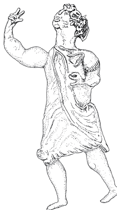
Fig. 8. Detail of krater from the Mithraeum in Mainz. The mystagogue makes the benedictio Latina gesture with his right hand. Exhibited as loan in the Archäologischen Museum Frankfurt am Main. Preserved height of the vessel is 39 cm. Drawing by the author after published photograph, Huld-Zetsche 2008, pl. 65, figure 3, scale 1:1.

being initiated. The bronze hands may therefore be associated with the Sabazian mysteries, and they have also been interpreted as evidence of the mysteries, although the gesture itself was described as one of blessing. 57 I would rather like to suggest that the gesture was adopted as a symbol of the initiation into the mysteries of Sabazios, an event that involved a mystagogue, who acted as a teacher or instructor. The mystagogue guided the mystos through the initiation process, i.e. the mystagogue acted in a position similar to that of Hermes, and especially in his role as Psychopompos . That Hermes also played this role in the Sabazios cult is explicitly demonstrated in wall paintings in a Roman tomb, where Hermes/Mercury is seen leading the deceased wife of a Sabazios priest into the Underworld. 58 Let us now discuss a few examples where the gesture may be associated with other mystery cults as well.