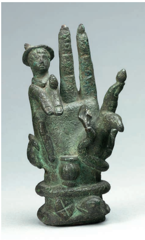
Fig. 7. Bronze hand of Sabazios with bust of Hermes. Musée du Louvre, inv. no. Br. 836. Height 12.2 cm, 3rd century AD.

significant that there is a link between the gesture and Hermes both in the earlier Greek vase paintings and on the Sabazios hands. It is hardly a coincidence in my opinion, and I would like to suggest that Hermes was closely associated with Sabazios because of his role as Psychopompos . At least by the Hellenistic period, the gesture seems to have signified speech, and was a suitable gesture to signal the instructions or secrets learned when