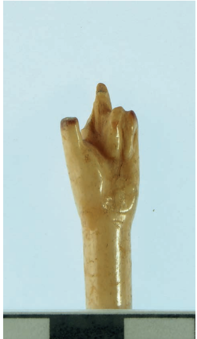
Fig. 4. The hand on top of the bone pin from Gordion. The thumb, index and middle fingers are broken off, but were held straight, while the ring and little fingers were folded.

The hand gesture is otherwise missing in material associated with Sabazios from Western Asia Minor, such as Lydia, from where we have some of the earliest material related to Sabazios. However, several terracotta fragments of in particular right hands were recently found in a deposit at a Hellenistic rock shrine at Priene. 39 These hands are slightly larger than life size and the fingers appear to have been held in various positions. The benedictio Latina gesture cannot be confirmed for any of these hands, but the fingers of several hands were broken off. The shrine has on basis of the finds been identified as one of the Mother Goddess. 40 Whether these hands were connected with Sabazios we do not know, but some of them were definitely not held in the benedictio Latina gesture and there is only one fragmentary hand that is a possible candidate for the Sabazios gesture, but unfortunately both the ring and little