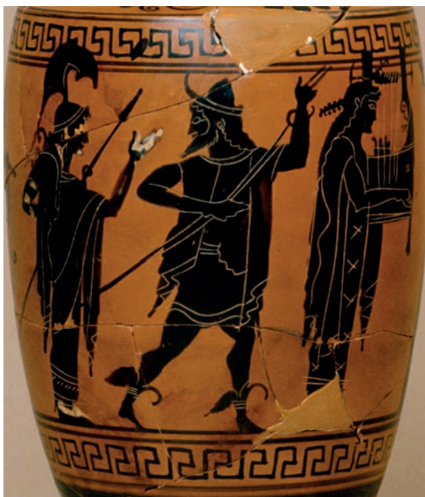
Fig. 5. The introduction of Herakles into Olympus. In front of Herakles (not seen in the image) are Athena, Hermes and Apollo. Hermes makes the benedictio Latina gesture with his left hand. Lekythos, c. 510–500 BC. Courtesy, the American School of Classical Studies at Athens: Agora Excavations, inv. no. P 24104.

fingers are broken off. 41 Furthermore, none of the hands were decorated with any attached symbols. However, that feature may be later, as the earliest dated Sabazios hand from Dangstetten (see above) does not carry any other symbol than the snake. Of interest is that these hands from Priene may have filled a similar function as the Sabazios hands, as at least one of them has a hole on the lower arm that was probably used to attach it to a wooden stick. 42 Further, as the fragmentary hands were all found in a shrine some form of cultic connection appears to be the most plausible interpretation.