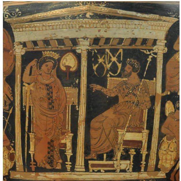
Fig. 6. Persephone and Hades in the Underworld. Hades makes the benedictio Latina gesture with his right hand. Apulian volute krater, c. 320 BC. Courtesy of The Spurlock Museum, University of Illinois at Urbana-Champaign, inv. no. 82.6.1.

The gesture is also known from later profane contexts, where it indicated speech, especially among actors. 53 The specific gesture is mentioned in two or three written sources. Quintilian ( Inst. 11.3.92–104, c. AD 95) listed various gestures performed by a Roman orator, and some scholars are of the opinion that the benedictio Latina is not among those, while Richter argues that four variations of the gesture are listed. 54 All the gestures listed by Quintilian are speech gestures and he did not elaborate much regarding the use of them, so even if this gesture is indeed described it would only confirm