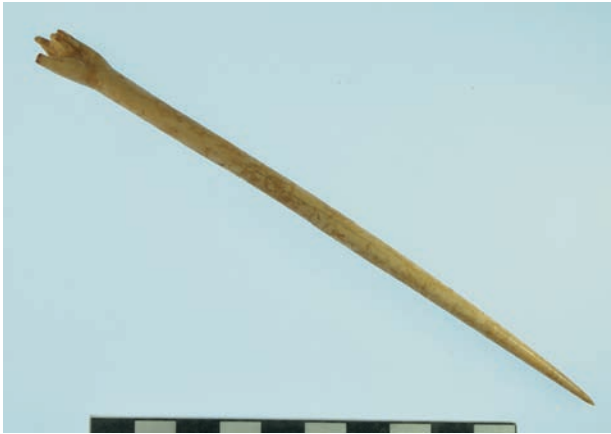
Fig. 3. Bone pin (inv. no. 2085-BI-170) from the city mound of Gordion. Preserved length 16.4 cm.

ture. 36 It is uncertain whether these are indeed hair pins; we may consider other functions, such as styli , drawing or writing implements used on wooden tablets covered with wax. The hand on top may be seen as a more appropriate decoration for a stylos rather than a hair pin.