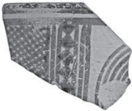
Fig. 9. Skyphos fragment 17 (Eretria, Sanctuary of Apollo Daphnephoros, inv. 04704-3).