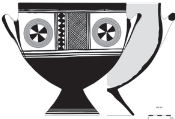
Fig. 3. Drawing of 2 (FM 86, 1957 – NAK 461). Drawing Anne Hooton.

flare; remainder of rim, including lip top, painted solid. The handle zone, thus defined, is decorated on either side, with the following: Central panel composed of two uneven segments, that to the right broader and crosshatched; that to the left decorated with a vertical row of seven lozenges (the lowest lozenge on one side curtailed, almost a triangle). Both