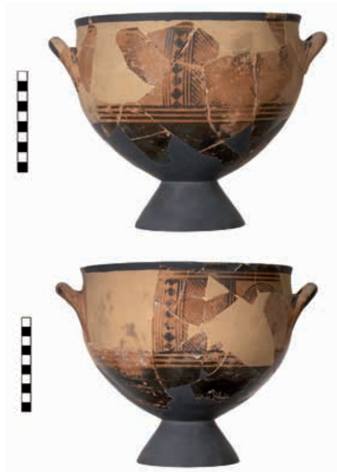
Fig. 7a–b. Photos of both sides of 8 (Sanctuary of Zeus on Mt. Hymettos).