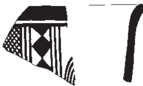
Fig. 8. Skyphos fragment, 11 (Asine, Barbouna area). After Hägg & Hägg 1978, 109, fig. 102, no. 59.

Wells 1983b, 206–262, figs. 197–198, nos. 784, 787–788 (note also no. 783, with the lozenges of the vertical lozenge chain individually decorated and no. 791, with crosshatched panel framed by vertical dogtooth).