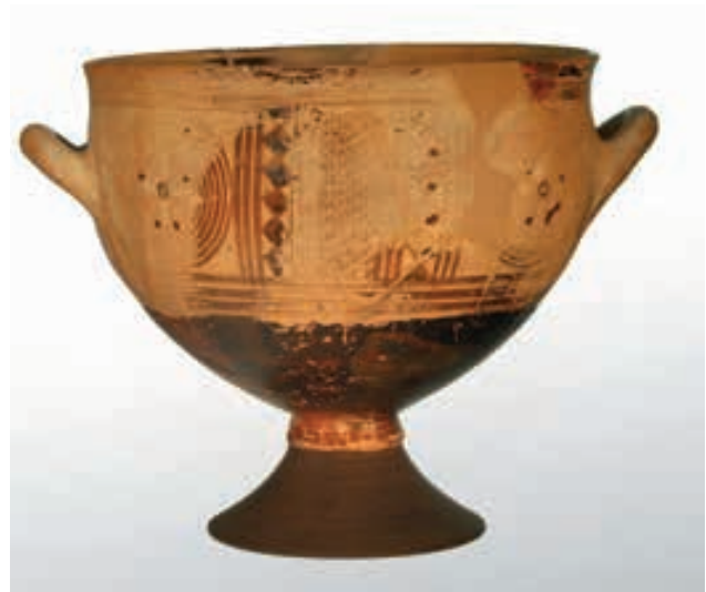
Fig. 10. Three views of 22 (Würzburg, Martin von Wagner Museum, inv. H 5393, said to be from Melos).