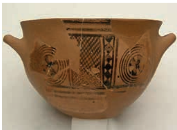
Fig. 4a–b. Both sides of 6 ( Kerameikos , inv. 606).