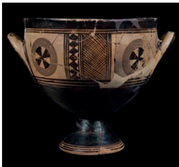
Fig. 1. One side of 1 (Acropolis South Slope, TM 86, 1957 – NAK 460).

Reconstructed from fir complete, except for small parts of body and rim, restored in plaster. Several of the joining fir on one side have been fire affected and thus discolored slightly gray, joining directly with fir not affected by fire. This secondary burning is limited to about one-third of the upper body on one side and is not very pronounced. The fact that some of the joining fir are burnt, while the remainder is not, indicates that the vessel broke up at some point during the funerary ritual. Condition otherwise excellent.