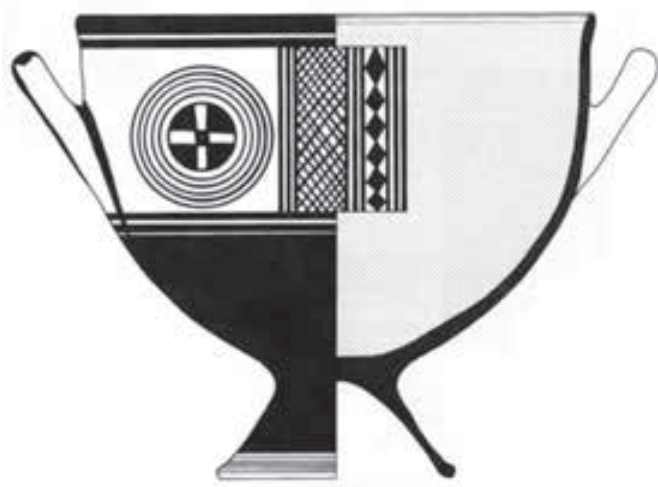
Fig. 11. Drawing of 24 (Knossos, North Cemetery 207.7). Drawing courtesy British School at Athens.

24. Knossos, North Cemetery 207.7 (Fig. 11) Coldstream & Catling 1996, 197, 398, fig. 124, Tomb 207, no. 7.