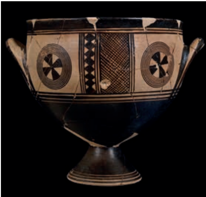
Fig. 2. One side of 2 (Acropolis South Slope, FM 86, 1957 – NAK 461).