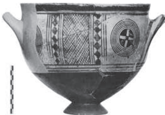
Fig. 5. One side of 7 ( Nea Ionia , no. 46, National Museum , inv. 18109 (the foot is a modern restoration). ).