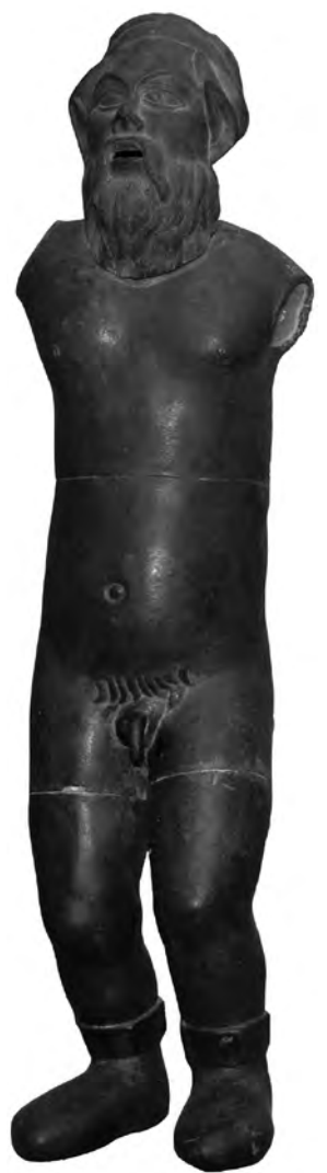
Fig. 12. A bronze sculpture representing Marsyas was found in the vicinity of the forum of Paestum.

those shown in the type discussed. His right arm is not lifted straight up, as that of the other satyrs, but held out in a 90-degree angle from the torso.<sup>54</sup> The raised arm in this case is similar to the iconography of Marsyas in the forum as shown on the provincial coins, where the raised arm is similar to the gesture of the ad locatio .<sup>55</sup> Like the satyr in the Galleria dei Candelabri he has an animal skin slung over the shoulder of the raised arm, but it is not tied around the torso.<sup>56</sup>