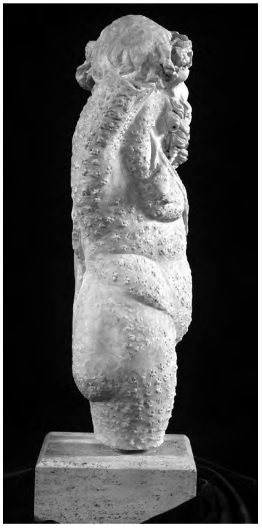
Fig. 2. The right-hand side of the satyr of the Palazzo Massimotype in Rome.

on aspects such as models, replicas and stylistic evolution. But despite their small size, the satyrs of the sculpture type discussed in this article show great similarity, even regarding details. It is therefore clear that they refer to a common motif and that care was taken to make this visible. I will refer to the sculptures as satyrs of the Palazzo Massimo-type, after the location of the best preserved replica, the one belonging to the Museo Nazionale Romano, which is actually housed in the Palazzo Massimo alle Terme. The figures considered to be replicas within this sculpture type are rendered in the same manner as