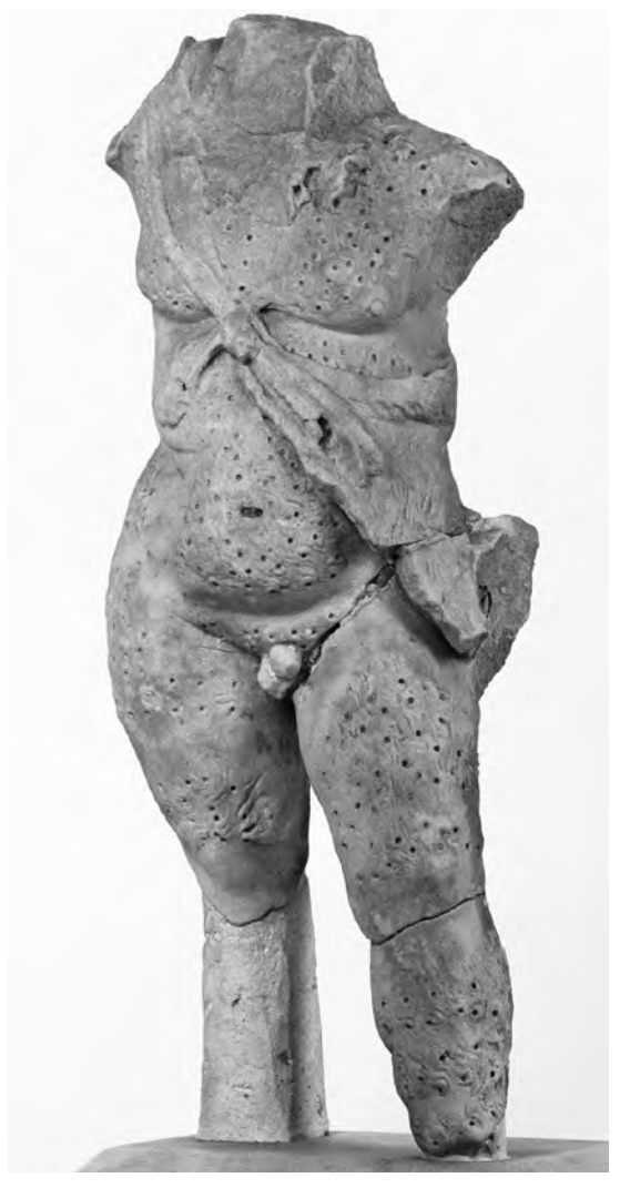
Fig. 5. The satyr of the Palazzo Massimo-type in the collections of the Musei Vaticani. © Deutsches archäologisches Institut–Rom. Neg. D-DAI-Rom 1989 Vat. 0576.

the left leg was placed quite far from the right, though the left foot cannot have been lifted much. The curly body hair covers the leg all the way down to the ankle.<sup>9</sup>