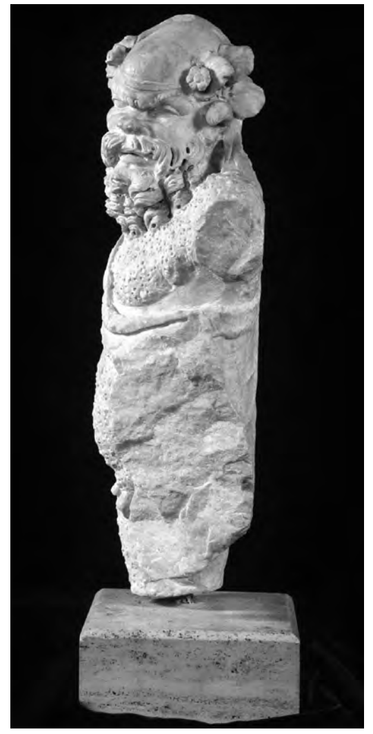
Fig. 4. The left-hand side of the satyr of the Palazzo Massimotype in Rome.

The sculpture in Rome shows the head, torso and most of the right thigh of the paunchy satyr (Figs. 1–4). The head is tilted to the left. The right arm, of which the armpit is preserved, was stretched straight up, while the left shoulder shows that the left arm must have been held lower. The weight was placed on the right leg. The satyr is bald, with short, curly hair on the back of the neck and over the temples. He wears an ivy wreath with leaves and berries over the temples and a ribbon over the forehead and the neck. The ears are elongated, pointed and tilted forwards. The face is dominated by the full beard with corkscrew locks reaching down over the clavicles. Curly body hair covers the torso and the preserved thigh.