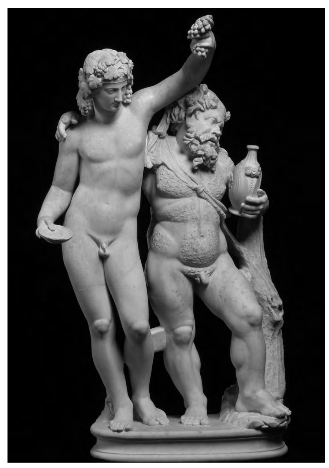
Fig. 6. The replica of the Palazzo Massimo-type in the Musée du Louvre has been heavily restored and inserted in a sculpture group representing Bacchus and Silenus.