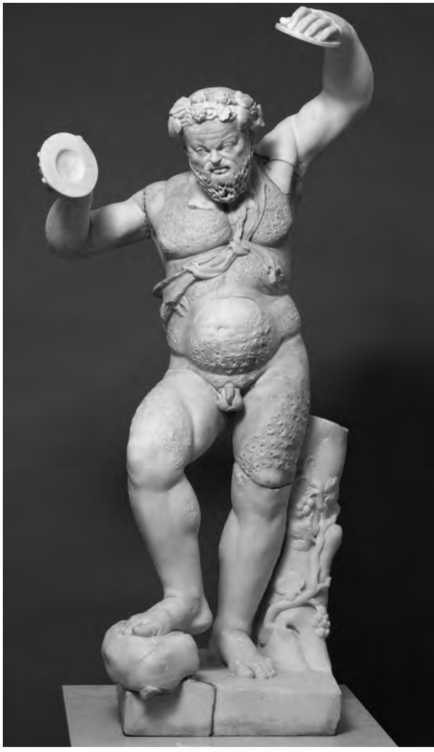
Fig. 7. The satyr of the Palazzo Massimo-type in the collections of the National-museum in Stockholm.

satyr in Rome it is placed over the shoulder ( Fig. 1 ), but on the other three sculptures it is placed over the chest ( Figs. 5–7 ). Unfortunately I have not been able to study the back of the sculpture in Paris, but the backs of the three sculptures in Stockholm, Rome and the Vatican are all schematically worked. However some differences should be noted. On the satyr in Stockholm the back of the figure is either very damaged or left almost completely raw: not even the continuation of the nebris is rendered on the ancient fragment. Some folds of the animal skin have been added by the restorer. The back sides of the replicas in Rome and the Vatican are rather flat, but the satyr's body hair and the nebris are shown (For the replica in Rome, see Figs. 2–4 ).<sup>12</sup>