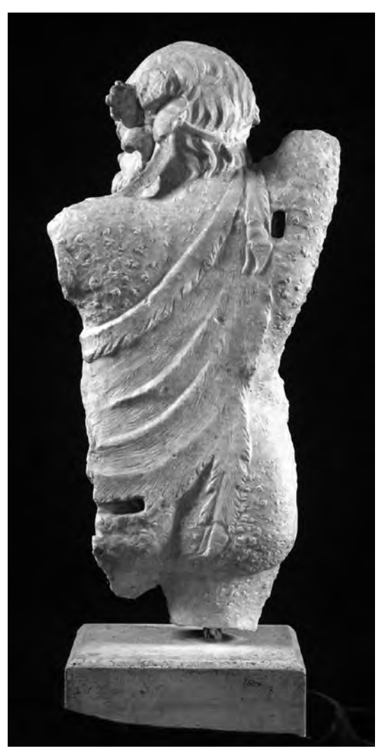
Fig. 3. The satyr of the Palazzo Massimo-type in Rome seen from the back.