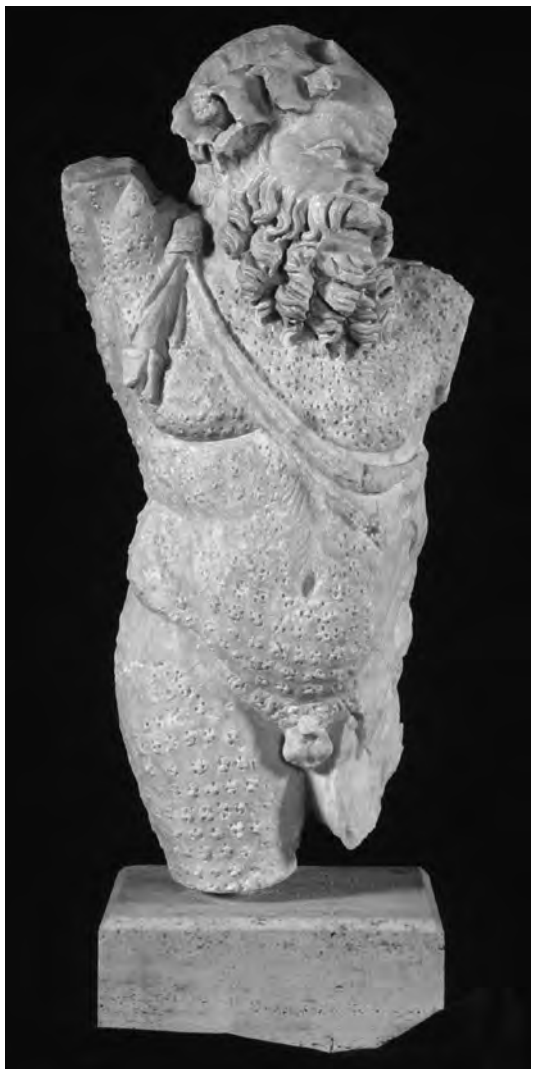
Fig. 1. The satyr in the Palazzo Massimo alle Terme, belonging to the Museo Nazionale Romano in Rome, is the best preserved replica of the Palazzo Massimo-type and the only one with a certain provenance.

on aspects such as models, replicas and stylistic evolution. But despite their small size, the satyrs of the sculpture type discussed in this article show great similarity, even regarding details. It is therefore clear that they refer to a common motif and that care was taken to make this visible. I will refer to the sculptures as satyrs of the Palazzo Massimo-type, after the location of the best preserved replica, the one belonging to the Museo Nazionale Romano, which is actually housed in the Palazzo Massimo alle Terme. The figures considered to be replicas within this sculpture type are rendered in the same manner as