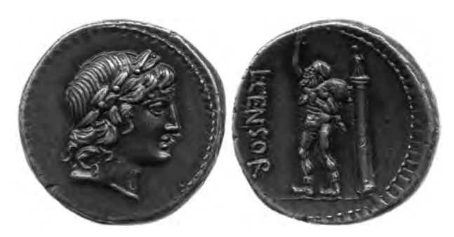
Fig. 10. One of the coins minted by L. Marcius Censorinus in Rome in 82 BC. The obverse shows the head of Apollo and the reverse the sculpture of Marsyas which stood in the Forum Romanum.

reliefs the satyr stands with his weight placed on the right leg while the left is placed more farther forward than the right one (Fig. 11). The coins and the cameo differ to this point: here the right leg is placed before the left (Fig. 10). This may however be an alteration made so that the legs would not overlap. Another possibility is that different versions of the sculpture are rendered: after all, the sculpture might have been replaced during the two hundred years that separate the two depictions. For instance, the sculpture may have been damaged during the Neronian fire of AD 64. The position of the legs aside, the iconography is the same in the depictions mentioned above, at least as far as one can tell. Marsyas is rendered as a paunchy satyr who holds a wineskin on his left shoulder with his left hand. He is naked except for a set of boots. On the coins Marsyas holds his right arm raised and he appears to be wearing something on his head which could be understood as a cap, a fillet or a wreath.