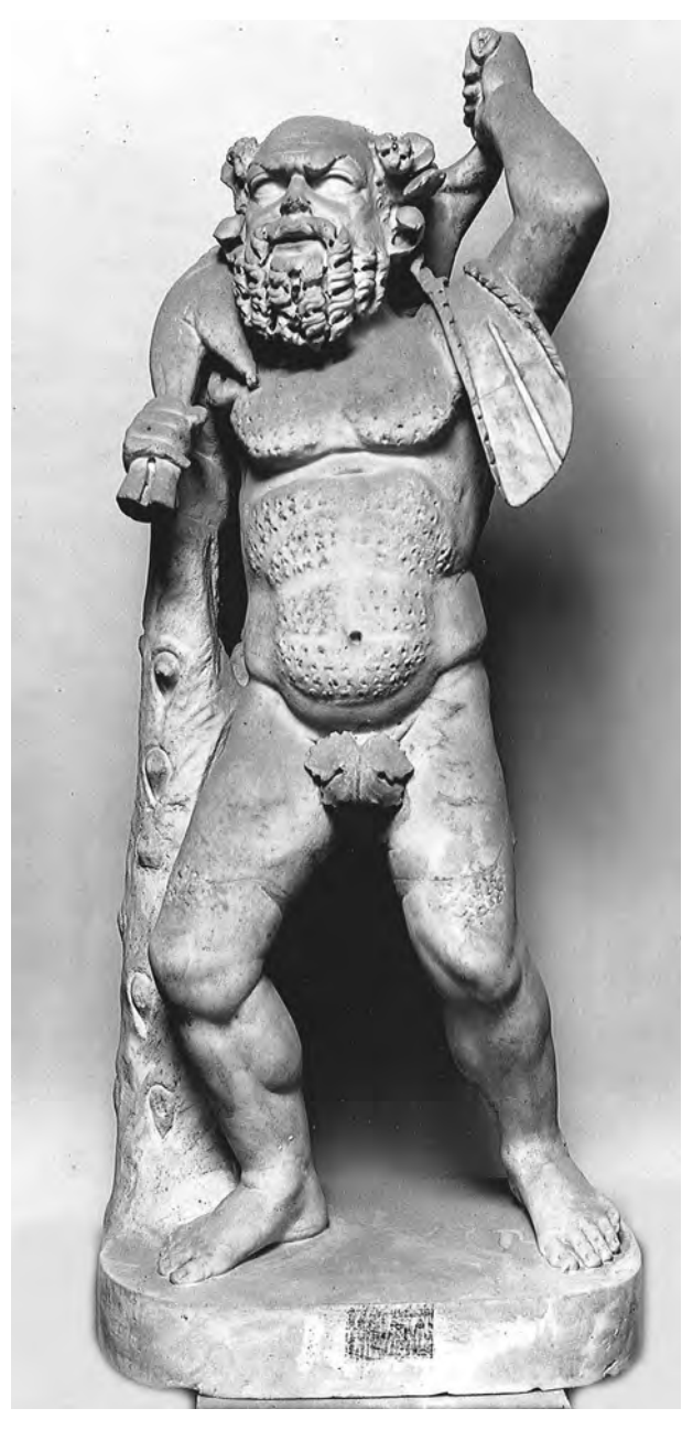
Fig. 9. The fountain figure found in the Villa dei Quintili is restored; the larger part of the left arm, the legs from the thighs and downwards, and the lower part of the support and the plinth are later additions, as are parts of both wineskin and nebris. © Musei Vaticani, neg. no. XXXII.53.2.

the pose of the fragmentary satyr in the Vatican clearly resembles that of Apollo Lykeios, Amelung suggested that the subject had been transformed a second time, to be used on a member of the wine god's thiasos. <sup>25</sup> The most con-