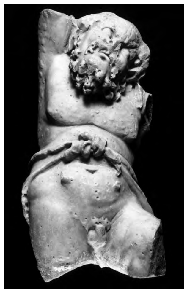
Fig. 13. A small-scale sculpture in the Museo Arqueológico Nacional in Madrid is closely related to the satyrs of the Palazzo Massimo-type and to the motif of the Marsyas in the forum.

Leaving the question of iconography aside, one still has to ask why the motif of the Marsyas in the forum would