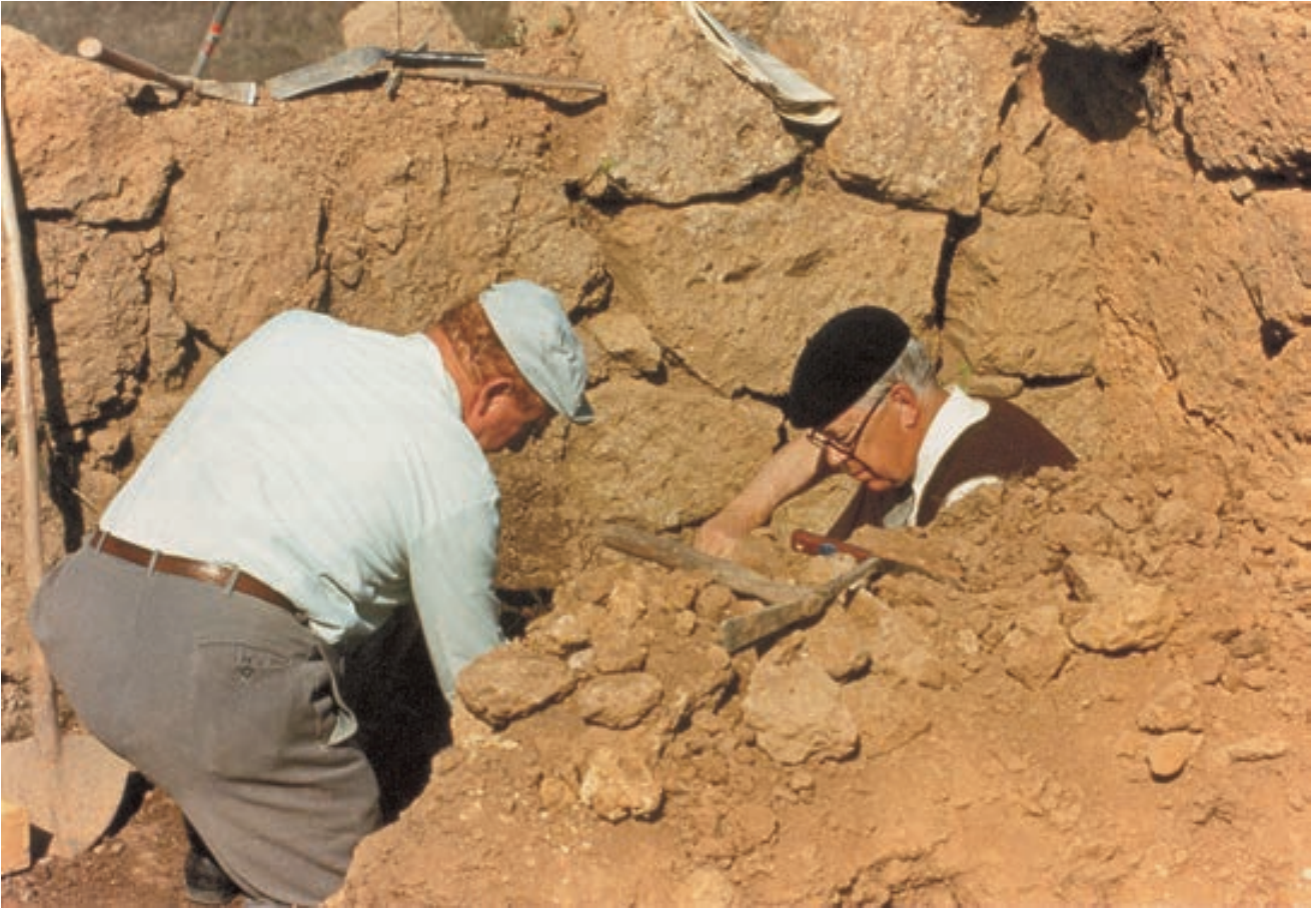
Fig. 27. King Gustaf VI Adolf and maresciallo Onofrio at work in room Ba.

intensified documentation and study in the 1990s some of the now unnecessary features related to the walkways were eliminated, especially a terrace and several artificial fills, all of which had obscured the stratigraphy and complicated the close study of walls and foundations.