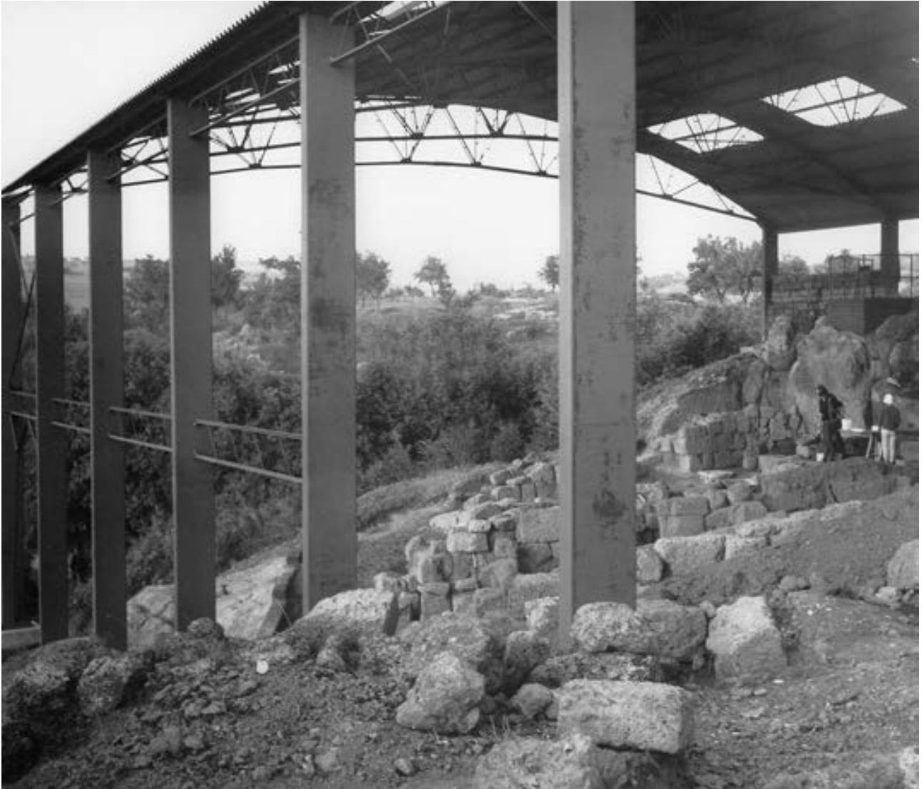
Fig. 30. The old Capannone 1965–2002.

1965 did not see much progress regarding the major excavation zones, in particular the Borgo NW. 43