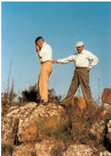
Fig. 28. King Gustaf VI Adolf photographing the Borgo NW with maresciallo Onofrio.

ports to the Soprintendenza and the 1960 report in Notizie degli Scavi . 41 A further, even more serious problem was the economic difficulties of creating an efficient work structure for the demanding publication activity and of correlating excavation and post-excavation work with Swedish university curricula. The requirements on the PhD dissertations were, at that time, that they were supposed to discuss problems rather than producing the mainly descriptive work of regular excavation reports. Thus, when back in Sweden, the San Giovenale excavators, like their peers at Luni sul Mignone, had to concentrate on other academic work. This led to the delaying of the analysis and publication work of their excavations. 42 The dissertations once finished, teaching and other research jobs tended to make the work on the San Giovenale excavations a cura posterior , handled only during too short summer vacations. Thus, the 15 years after the end of the field work in