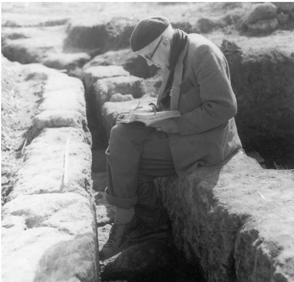
Fig. 22. Professor and director Axel Boëthius in 1957.

from a height of c. 5 m (Fig. 29). It resulted in an extremely useful photographic plan of the entire excavation (Pl. 2). 39