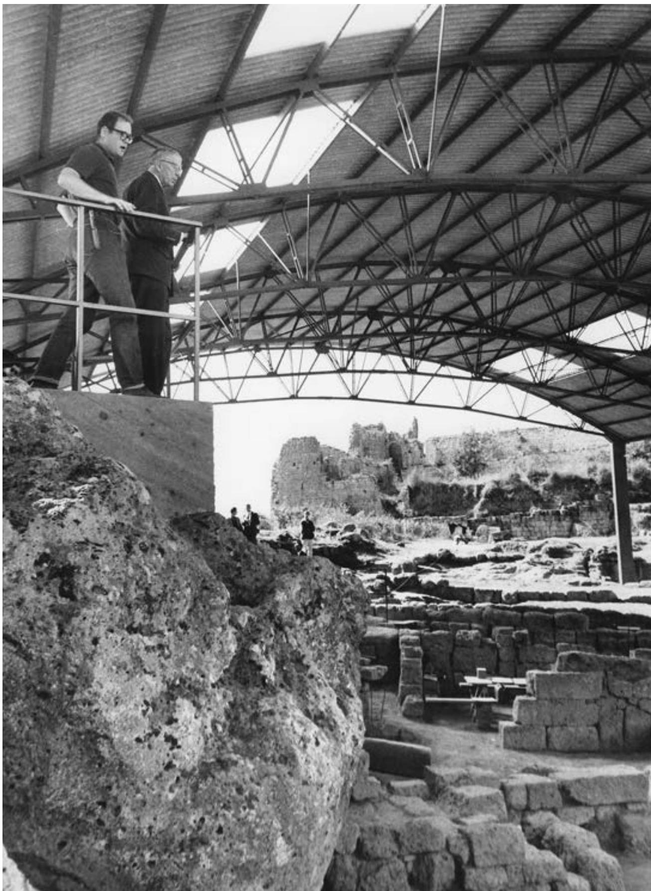
Fig. 1. The excavation area of Borgo NW in 1965. Carl Nylander and King Gustaf VI Adolf under the Capannone , a structure that was funded by the king.